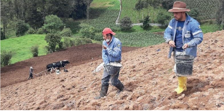
Figure 1: Wheat Field Planting in Tungurahua Province.

Wheat production in marketing year (MY) 2024/25 (July-June) is forecast to remain slightly over 14,000 metric tons (MT), the same as the previous year's harvest. Wheat production in Ecuador is insufficient to meet local demand, with less than 7,000 hectares (HA) in production. The milling industry in Ecuador is entirely dependent on imports.