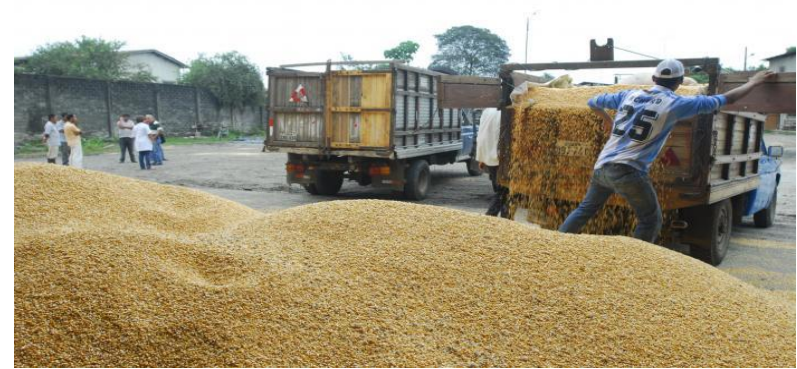
Figure 6: Local Corn Arriving to Warehouse.

addition, lower wheat prices in MY 2023/24 contributed to further substitution. Ecuador's Feed Producers Association (APROBAL) has indicated that in addition to wheat, animal feed producers continue experimenting with and using corn alternatives such as domestic rice byproducts and the increased use of U.S.-sourced DDGS. Since February 2023, DDGS can be imported without paying the 12 percent value added tax that had previously been a barrier. DDGS are now used in Ecuador's shrimp, pork, and poultry industries. The United States exported 55,000 MT of DDGS to Ecuador in MY 2022/23, an increase of 99 percent compared to MY 2021/22.