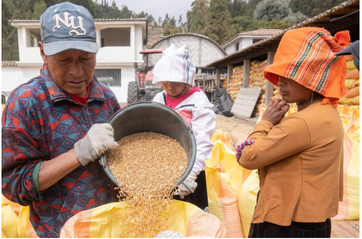
Figure 2: Small Farmer Harvest and Processing

Per capita human consumption of wheat in Ecuador for MY 2024/25 is estimated at 43 kilograms (kg)/year. In MY 2024/25, the pasta and bakery industries expect a decrease in consumption as the official price for wheat is expected to increase eight percent, from $22 to $24 for a 45 kg bag.